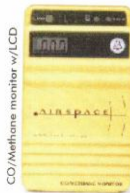
CO/Methane monitor w/LCD