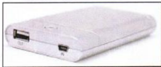
Charge Other Devices from USB OUT Port Charge the Power Pack with the USB IN Port

Li-Ion Slim Design - 4 X 2.5 X 0.5 Inches Multi-Color LED Charge Status 3400 mAh Capacity MSRP: $49.99